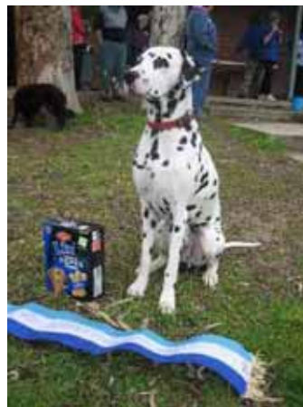
ZIGGY JUMPING (non trialled) SALLY HAYNES