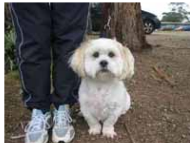
BUTCH ADVANCED PUPPIES MERLINE GALPIN