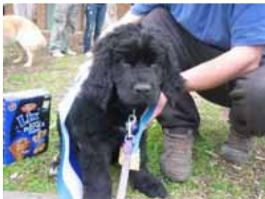
LILITH PUPPIES GARRY COOK